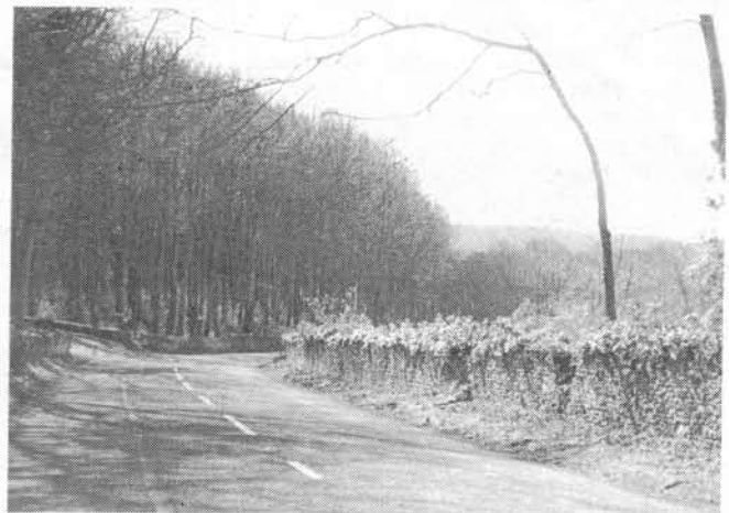
....and as it is now