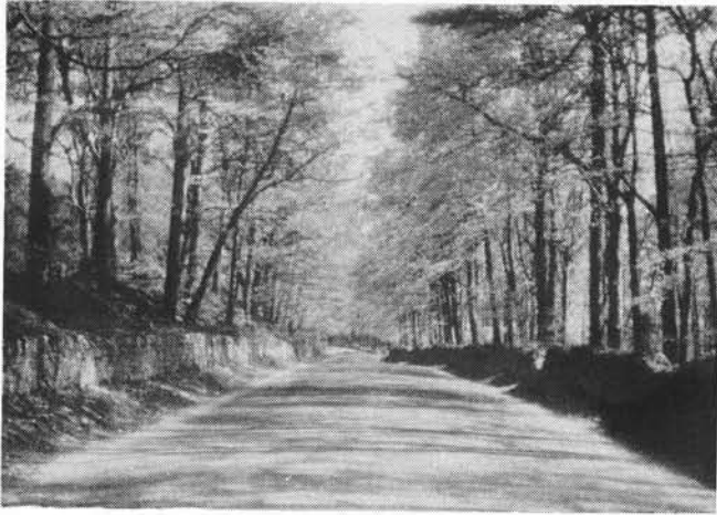
Painswick from Gloucester Road as it was....