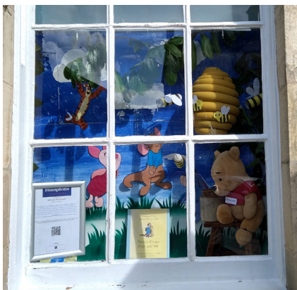
Easter Egg hunt and activities in the Churchyard organised by the Painswick Playgroup