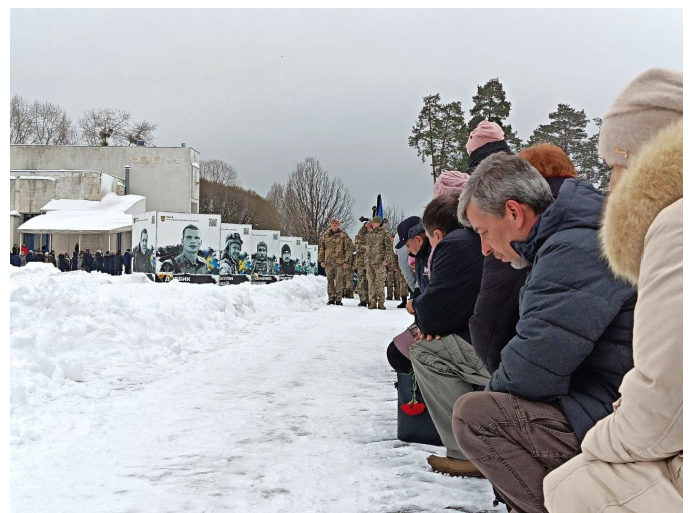
Funeral farewell to a hero of Ukraine in Slavutych. Reports from Slavutych on page 8.