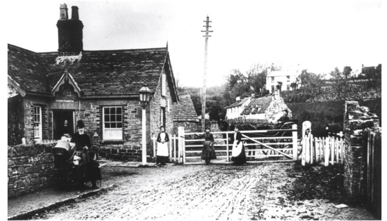
POOLWAY TURNPIKE, OCT. 31, 1888.