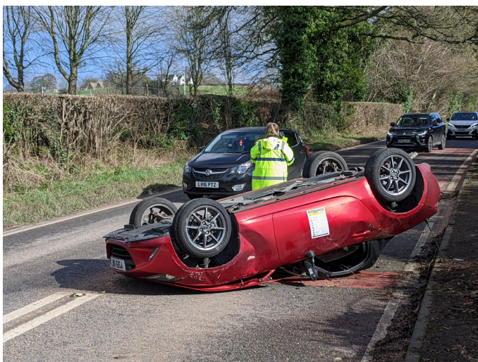
Two road accidents near Painswick on the same morning. Report on page 9.